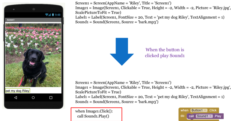
Fig. 3. An example where the user changes the functionality of when the image is clicked. Before the edit, nothing happens when the user clicks the image of a dog. The user commands to add a barking sound when the image is clicked. On the right side, you can see the function is added in code level and blocks being created