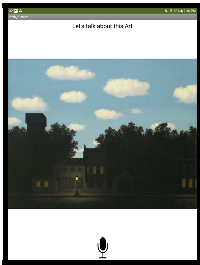
Fig. 1: First part of Mind Palette App

One of the main technical features of "Mind Palette" is its ability to appreciate artworks (Figure 1). The application provides users with a selection of artworks tailored to their emotional state, encompassing positive, neutral, or negative feelings. Users can engage in a conversation with the chatbot powered by GPT, who provides a brief explanation of the artwork. To elicit deeper emotional responses, GPT poses personal questions such as "How do you feel when you see this art?" or "Can you describe the emotions evoked by the color/shape?". Importantly, GPT adapts its follow-up questions based on the users' responses, tailoring the conversation to their specific emotional state.